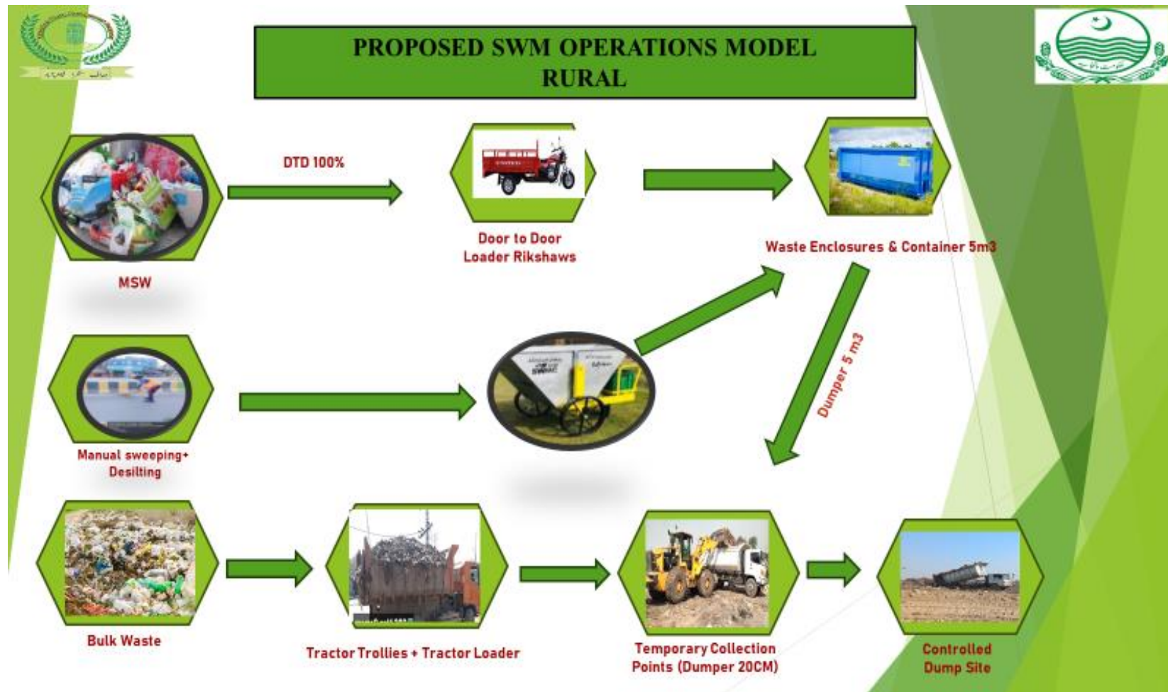
Figure 3: Proposed SWM Model for Rural Areas