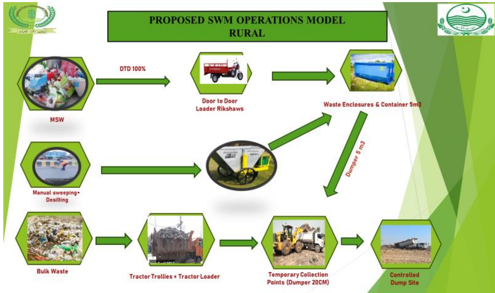
Figure 3: Proposed SWM Model for Rural Areas