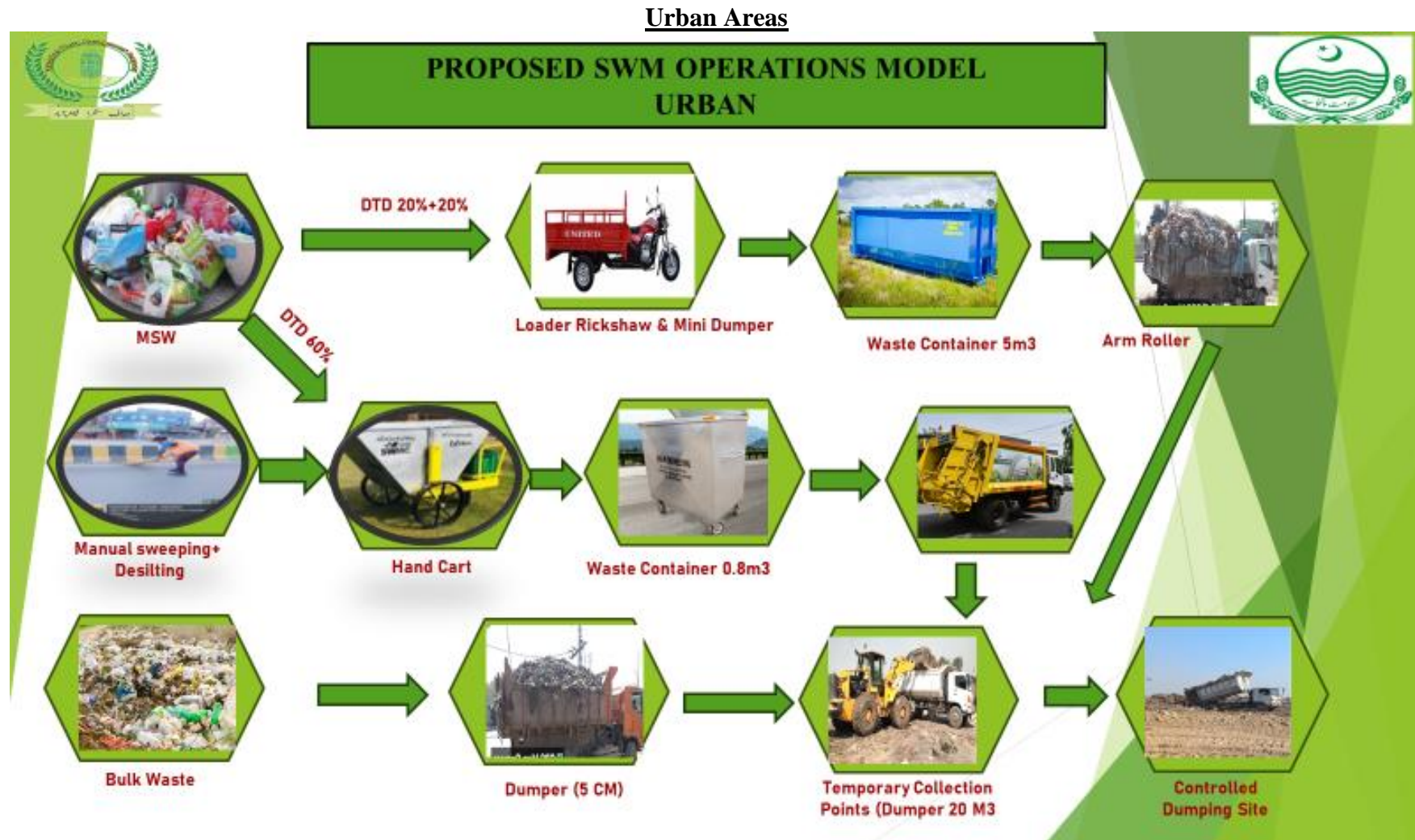
Figure 2: Proposed SWM Model for Urban Areas